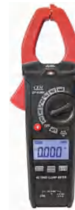
Model 9180C (Single molded plastic housing)

Accessories: Test leads, gift box with carrying case, Temperature probe and 1.5V AAA x 3 batteries